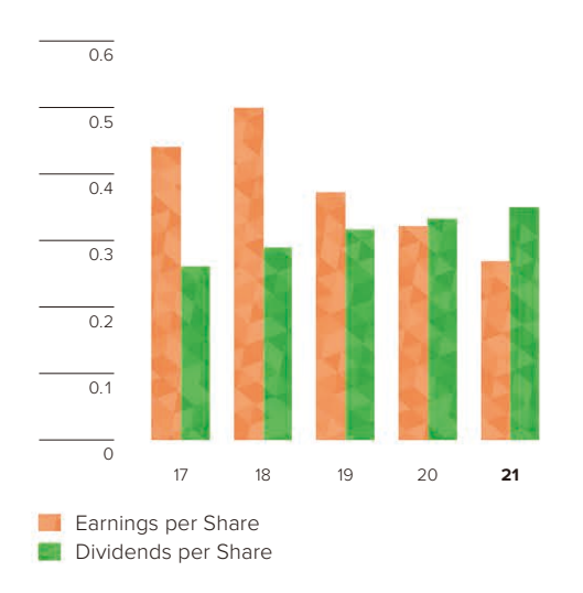
per Share (HK$)